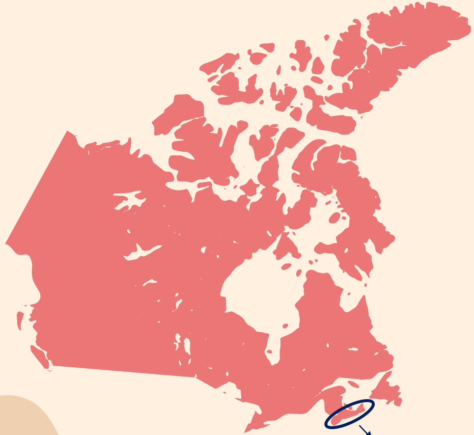
Province of Nova Scotia